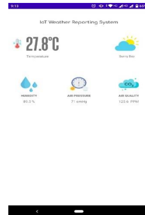
Fig: Android Application